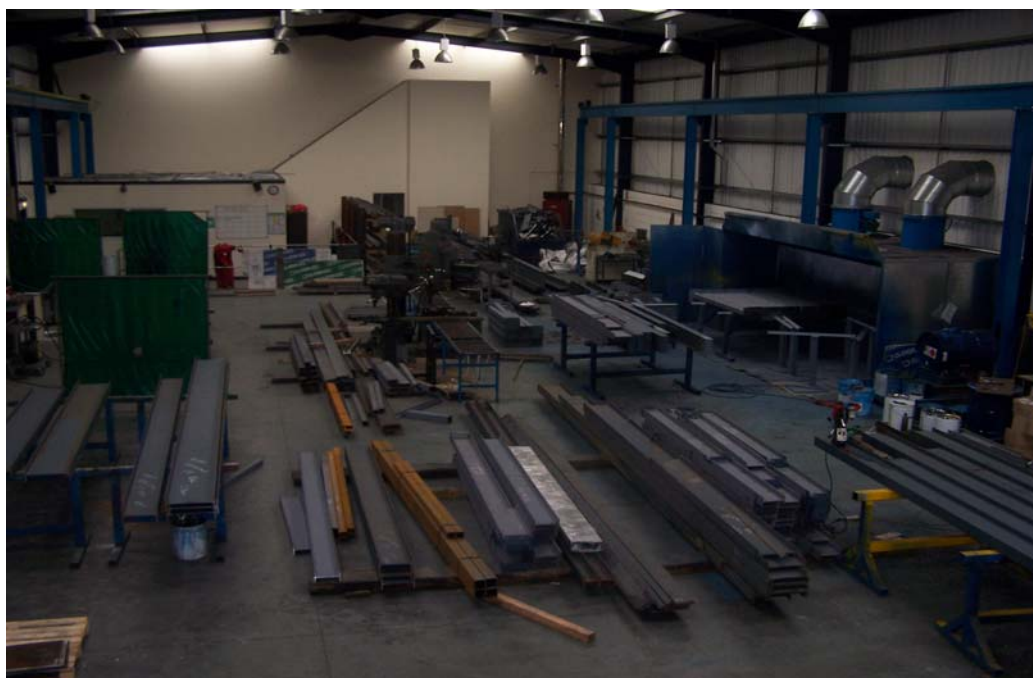
CSI FACTORY - STOKE PRIOR, BROMSGROVE

As you probably realise, CSI have been particularly busy of late - however other than one or two minor delays which have seen us having to "juggle" more than the usual number of balls, we would hope that we have coped well and proved that our ability to put £650K through both the office and works in a 10 week period is now a matter of record as opposed to mere boastful speculation!